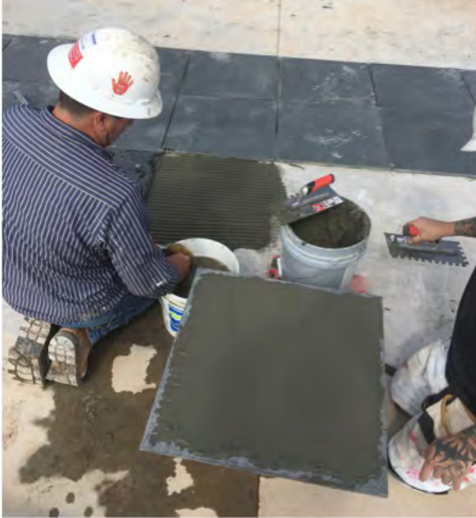
Merkrete 855 DUSTLESS XXL LHT Mortar was used to install 24" x 24" x 5/8" Black Granite throughout the reflection pool.