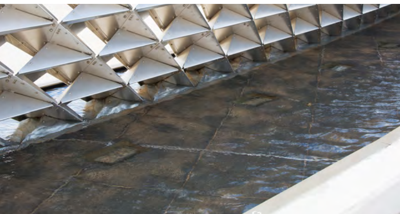
Merkrete Hydro Guard SP-1, 855 DUSTLESS XXL LHT Mortar and ProGrout were used to install 24" x 24" x 5/8" black granite throughout the reflection pool.

Later, he was assigned to the newly constructed escort aircraft carrier, USS Liscome Bay (ACV/CVE-56), and was on board during the ship's first mission to secure the Makin and Tarawa Atolls in the