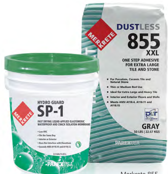
Merkrete Hydro Guard SP-1

It was critical that Darden Commercial Flooring chose a company that would be able to get the products delivered when required and to get the job completed on time. Merkrete is a member of ParexGroup, one of the largest companies and a worldwide leader in tile setting materials, façade finishes and technical mortars, established in 22 countries with 68 manufacturing plants and over 4,100 employees working to deliver innovative building solutions.