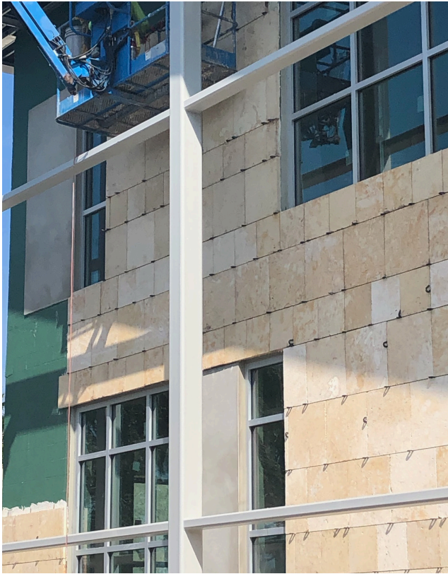
Exterior protected using Merkrete's Hydro Guard SP-1 waterproofing & crack isolation membrane.