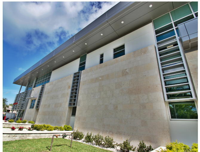
Merkrete 855 DUSTLESS XXL LHT Mortar used for installing 24" x 24" Coral Stone throughout the exterior.

Time is critical in rescue situations as fires can spread rapidly, and the window of opportunity to make a difference is narrow. In serious injury crashes, trauma victims need to get to appropriate facilities within a specific time-period or potentially face negative outcomes. Fire-rescue departments understand the need for an adequate response time to the various incidents and have the ability to begin these rescue operations quickly and within established safe operating parameters.