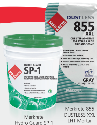
Merkrete Hydro Guard SP-1

www.merkrete.com 866-516-0061 Tech Support: 800-226-2424