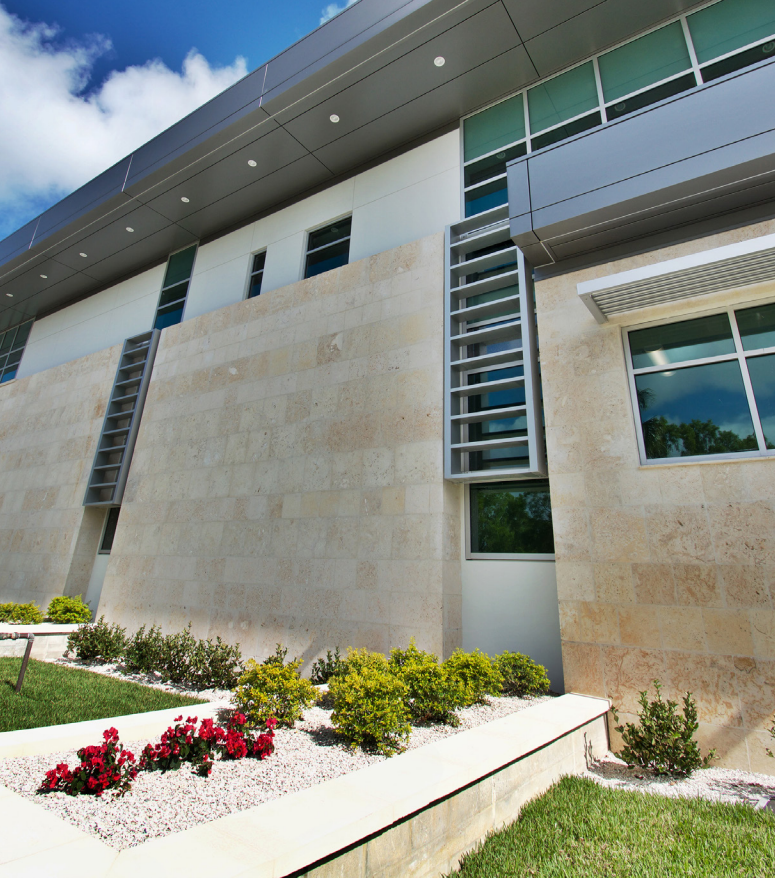
Additional exterior areas installed using Merkrete DUSTLESS 855 XXL LHT Mortar.

days, clearing the way for a new $6.5 million, two-story, 22,600-square-foot fire station, administrative headquarters and state-of-the-art emergency operations center.