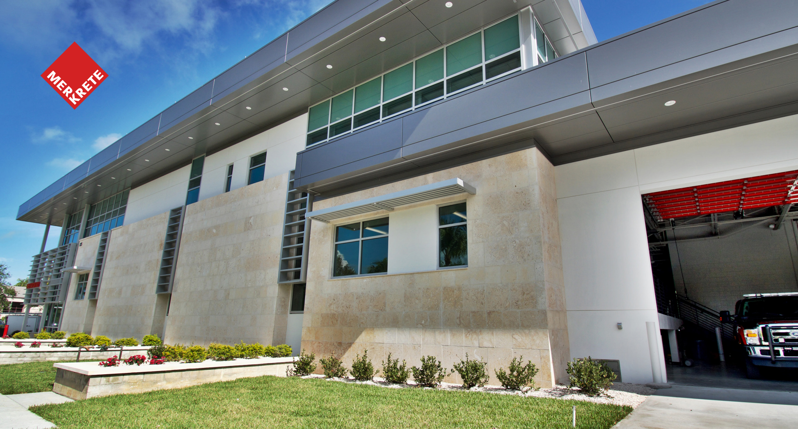
Naples Fire-Rescue Department Fire Station No.1.

Rescue is one of the most important functions of every fire department. From the first day of recruit school, firefighters are trained that life safety is the number one priority. Rescues are situations where firefighters promise their communities that they will endanger their lives to try to save another. It is a job responsibility that requires continual preparation.