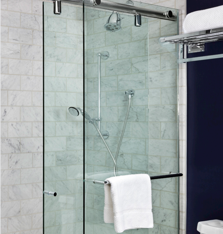
Merkrete's Hydro Guard SP-1 waterproofs the new in suite bathrooms.

affair inspired by the grand brasseries of Europe, with a modern and reimagined approach that focuses on sustainable products. The bright and airy space features a variety of custom furniture pieces, artworks, and mirrors nestled amongst the building's original architectural features, including historic Corinthian columns, expansive ceilings, and classically inspired stonework.