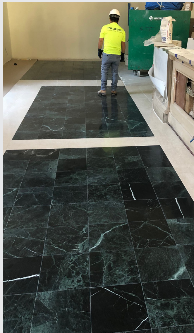
Merkrete's Underlay C provides flat surfaces for large marble tile.

Merkrete proved the perfect match for a specific challenge again considering the strength of the mortar it called for. "We used very large stone panels, which require a mortar with a super high bondability that can handle the sheer weight of the panels," says Killian.