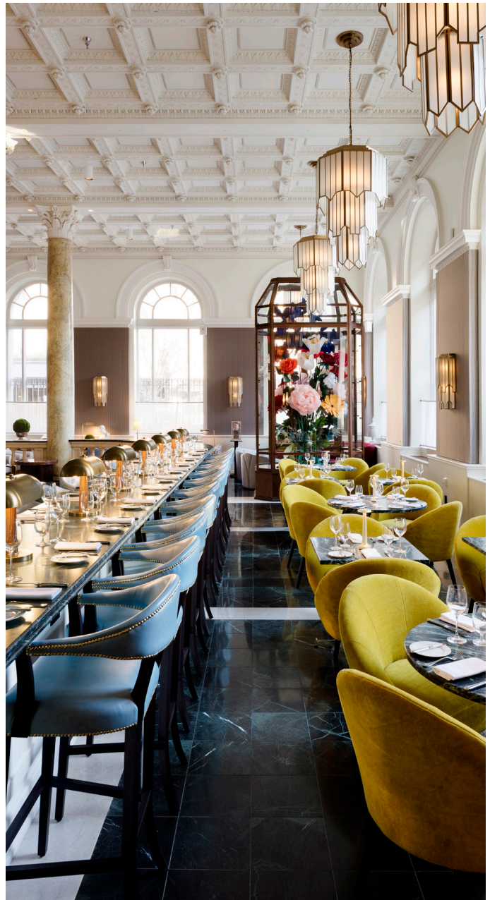
Café Riggs is an all-occasion affair inspired by the grand brasseries of Europe, with a modern and re-imagined approach that focuses on sustainable products.

With the Riggs Hotel having just recently celebrated its grand opening, guests flooded in to experience the fine culinary offerings and embrace the historical setting and incredible architecture Riggs has to offer. Located in the heart of downtown D.C., Riggs is ideally situated opposite the National Portrait Gallery and within walking distance of many of the capital's must-see attractions including The White House, Capitol Hill, the National Mall and Memorial Park. Having been rejuvenated over the last two decades, Penn Quarter is having a moment, offering a host of innovative restaurants and bars. In the years to come, more renovations may take place, but thanks to Profast Commercial Flooring and Merkrete, you can be sure the stone tiles will be standing strong.